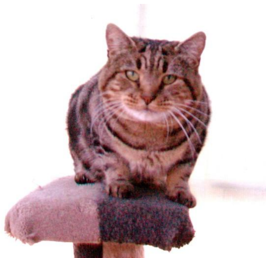
Bronze Grand Champion Encore Izoo Wassamatta (Australia)