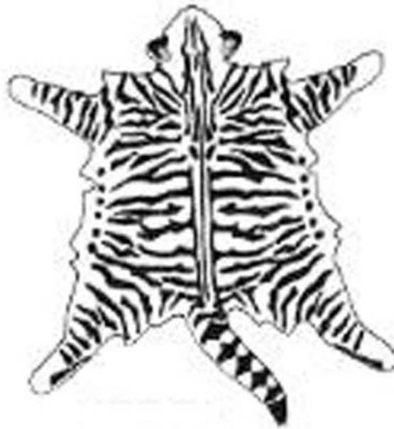
Mackerel Tabby Pattern – note; narrow stripes and three parallel spine-lines

Spotted (Sp) – the current thinking is that a specific single gene is likely to be responsible for the spotted tabby pattern, breaking up the mackerel or classic pattern into elongated or rounder spots respectively.