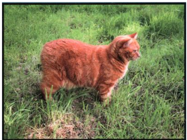
Grand Champion & UK Supreme Grand Premier Tattleberry Tudur (GCCF Supreme exhibit 2003)