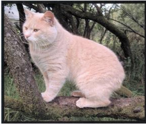
Champion Burmanx Guinness