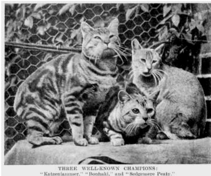
Champion and Premier Katzenjammer & Champion and Premier Bonhaki (1902)