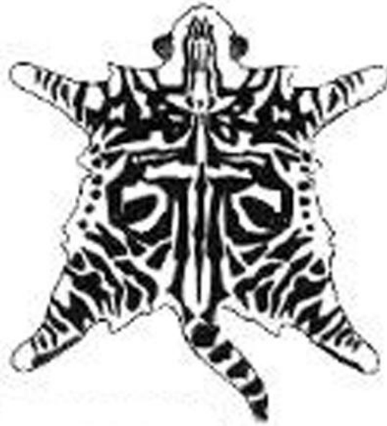
Blotched or 'Classic' Tabby Pattern